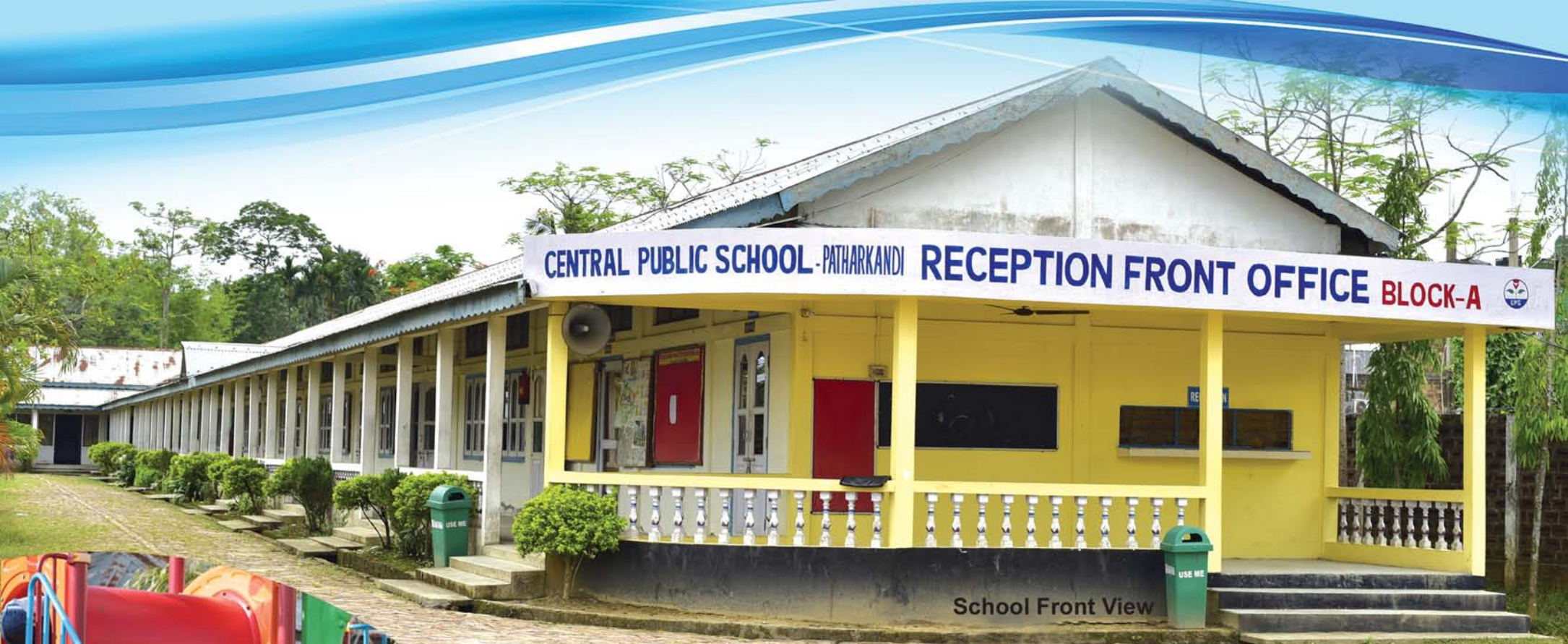
School Front View